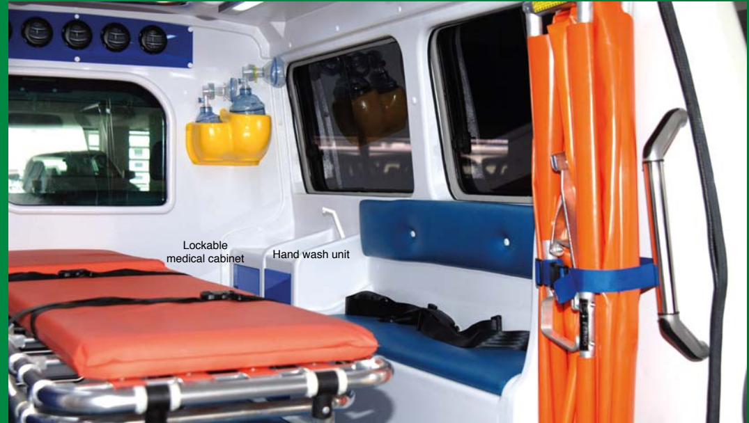
Lockable medical cabinet