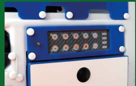
Electronic management system installed in patient's compartment