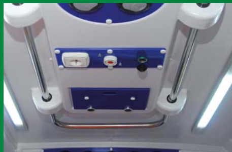
220V electrical and 12V lighter sockets, also with a Schrader oxygen connector fitted in the ceiling