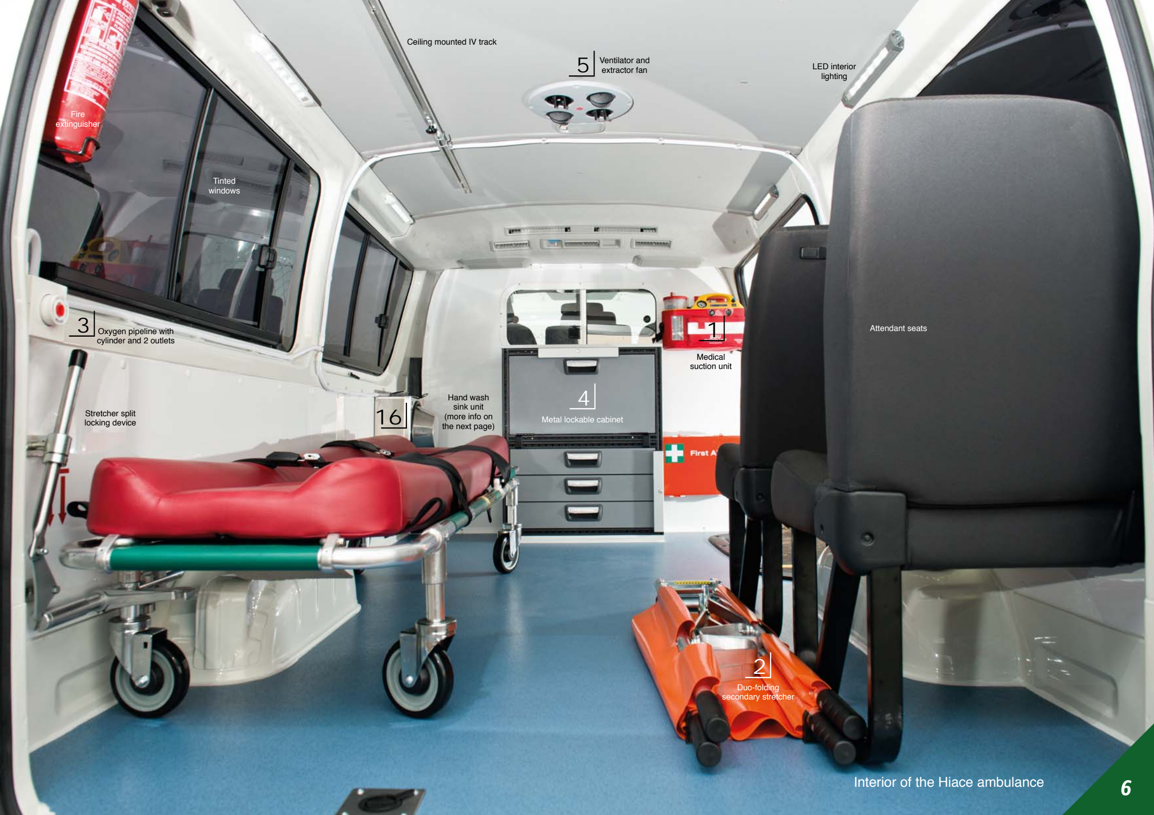
Ceiling mounted IV track