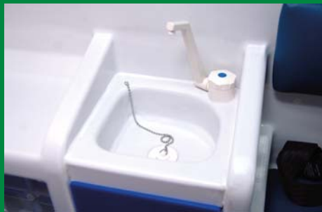
Hand wash unit