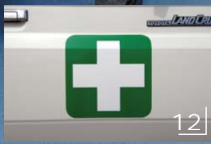
Ambulance identification stickers