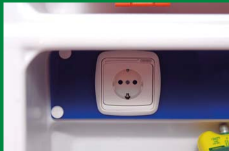
220V electrical sockets