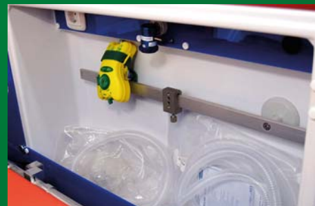
Ventilator, air entrainment valve and mask