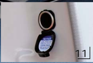
Close-up view of the 12V power socket