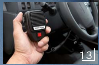
PA system handset