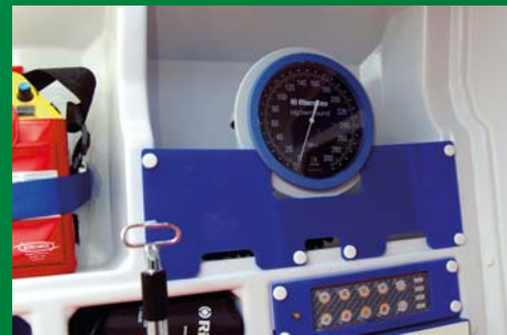
Wall mounted Sphygmomanometer