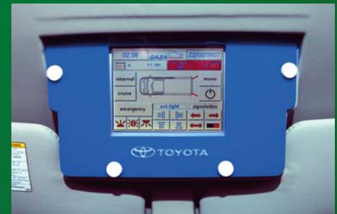
Touch screen electronic management system installed in driver's compartment