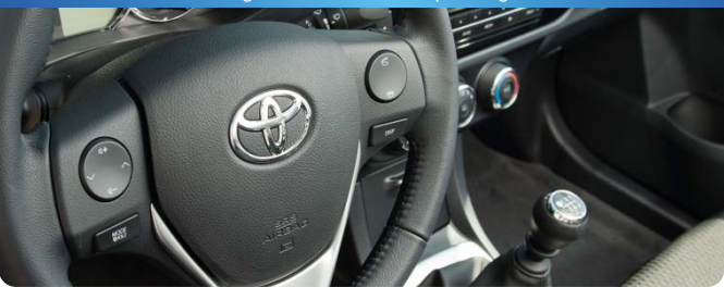
Leather steering wheel with audio, display and telephone controls (standard on both models Airbags for driver and front passenger

Rear boot space with a full size tyre stored underneath the carpet