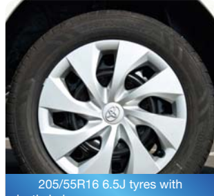
plastic hub caps (standard on both models)