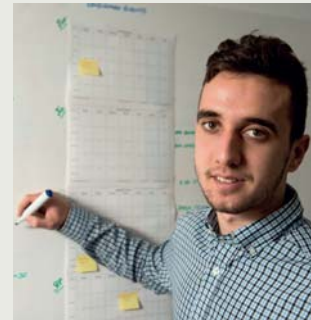
SYKES Garro Technical Services Operations Assistant